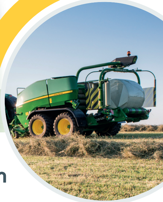
Agricultural machine produced at the John Deere plant in Arc-les-Gray