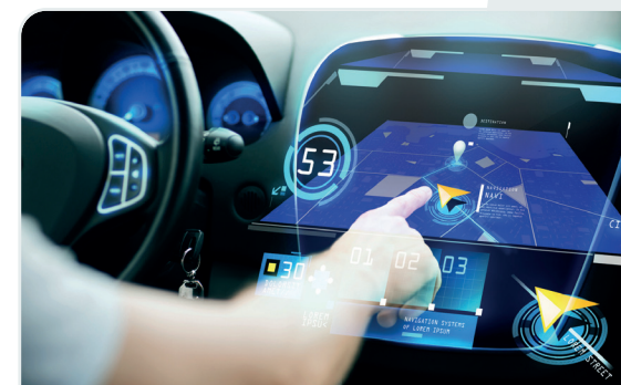
↑ Navigation system on a car dashboard