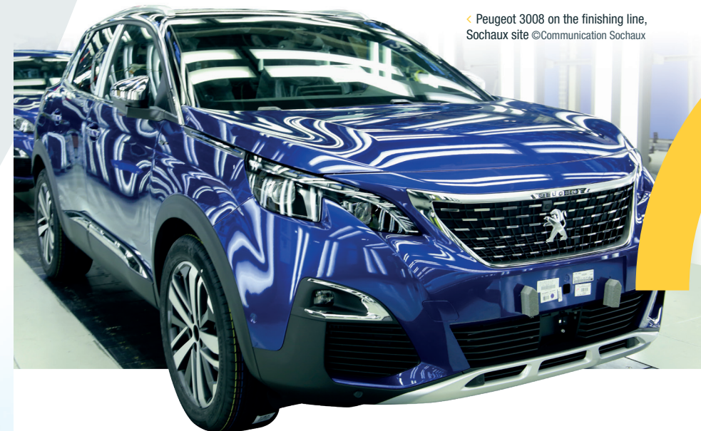
Peugeot 3008 on the finishing line, Sochaux site