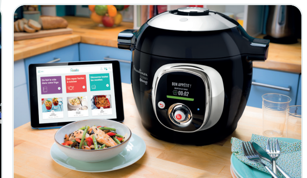
↑ Foodle, your recipe recommendation app ©Seb Group