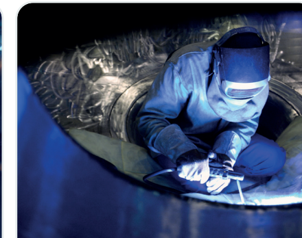
↑ Framatome, welding on an EPR steam generator